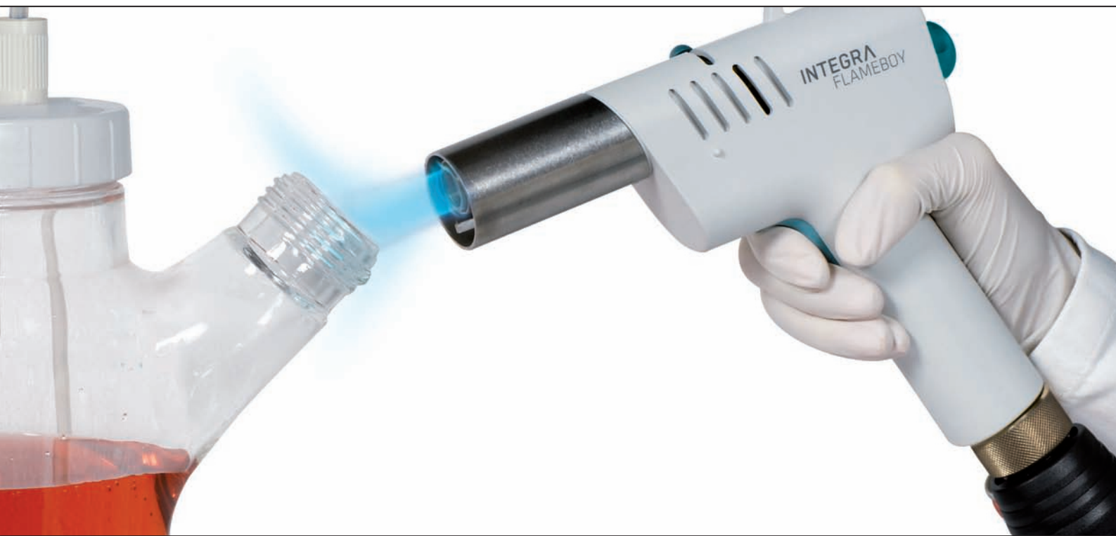
FLAMEBOY Surface sterilization at the push of a button